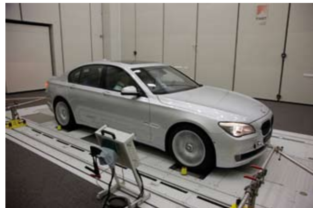
ABOVE: BMW acoustic test room with BCA cladding in Dingolfing, Germany

Depending on the calculated mode field of the